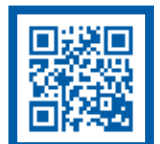
SCAN FOR DIRECTIONS

The DW Stadium has six disability pods for home and away supporters in wheelchairs, each able to comfortably seat seven supporters. Personal assistant seats are available to the side of the pods. Further wheelchair spaces may be found to the front of the west stand. Headsets for supporters with sight impairment may be reserved at the ticket office for a refundable fee of £10.